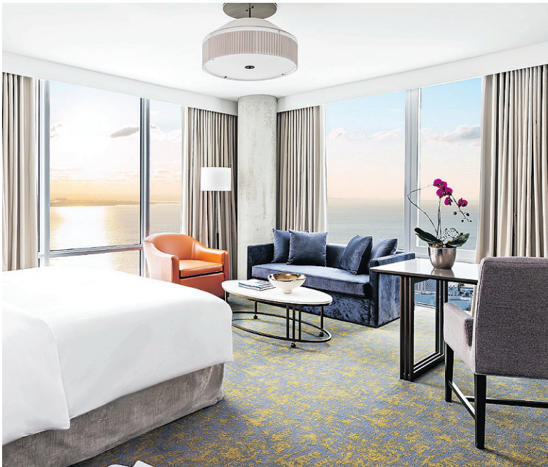
Lakefront rooms and suites offer views of the city and Lake Ontario.

Stephen B. Jacobs Group Architects of New York brings a human touch to the grandeur of Hotel X Toronto. The public spaces are dramatic, but they're individually designed, so you're not overwhelmed by the hotel's overall size. The lobby has 10-metre ceilings, flashy floor mosaics tiling and a living wall of plants. The Library Club Lounge is a serene hideaway with a fireplace, handsome leather furniture and a deck. The hotel incorporates the outdoors, starting with a huge expanse of gardens and fountains