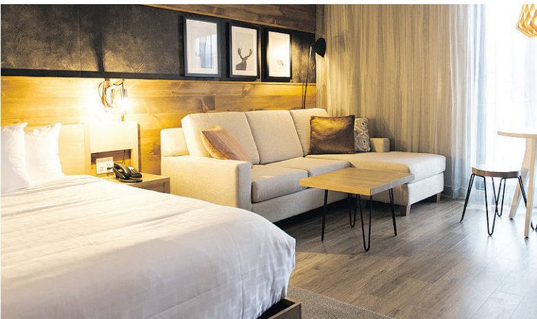
The rooms are understated, youthful and inviting. Many units have kitchenettes or full kitchens, gas fireplaces and balconies.