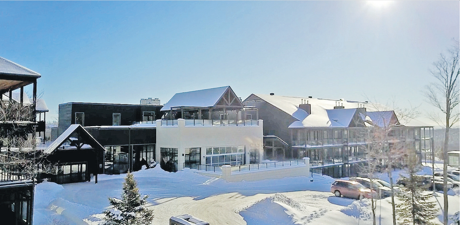
Familiar features from the hotel's previous life include a spa, fine dining bistro and burger pub.